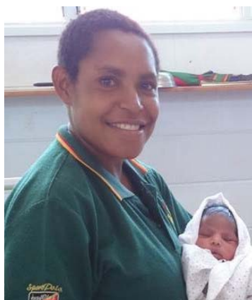
This Mom & baby are receiving their baby layette from YOU!