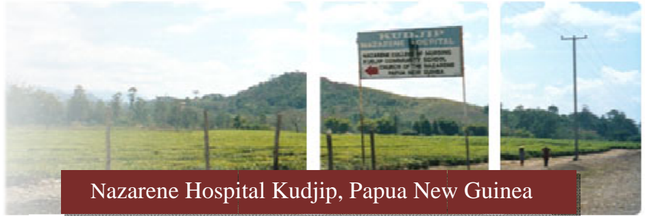
Nazarene Hospital Kudjip, Papua New Guinea